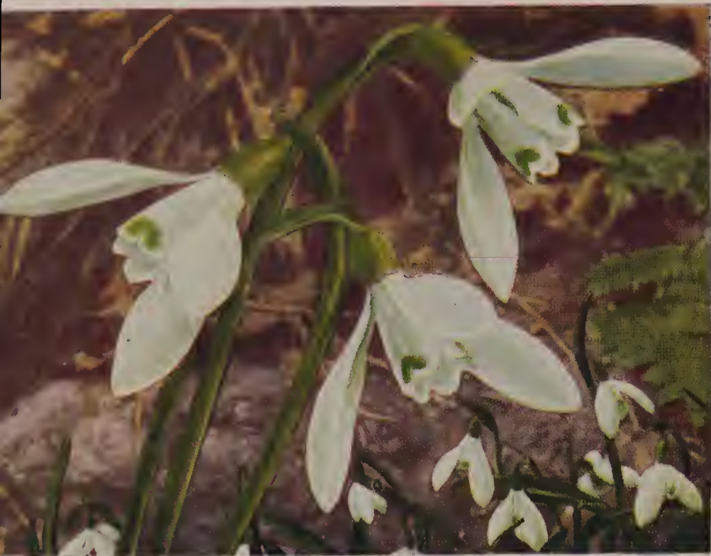
Galanthus or Snowdrops